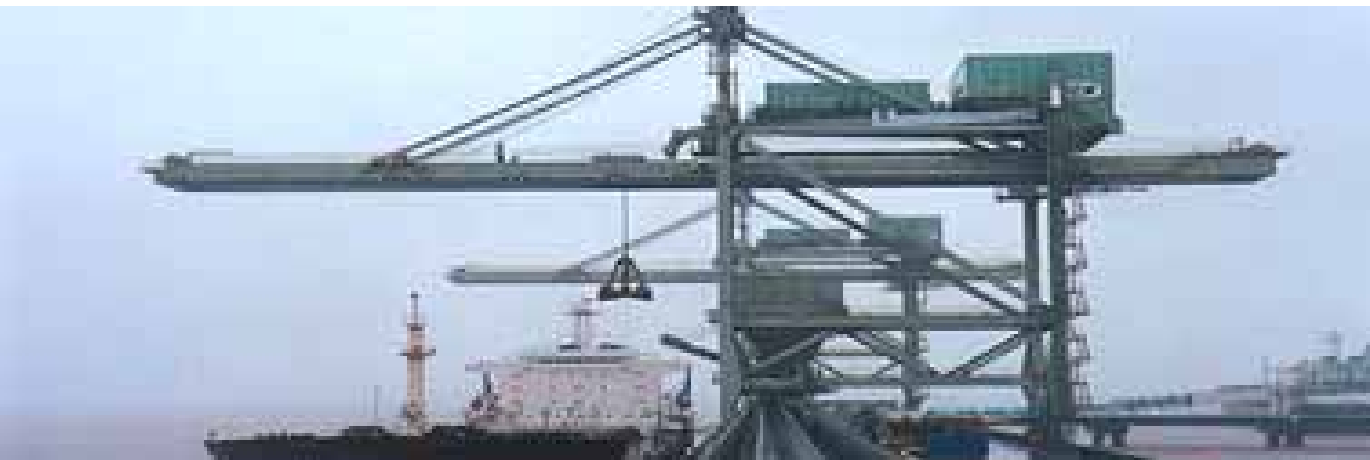
Quayside container crane