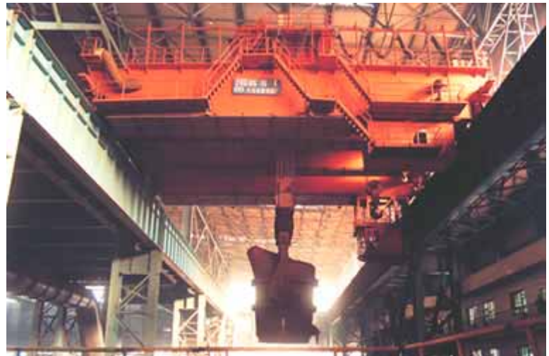
Crane for metallurgical industry (casting, slab, etc.)