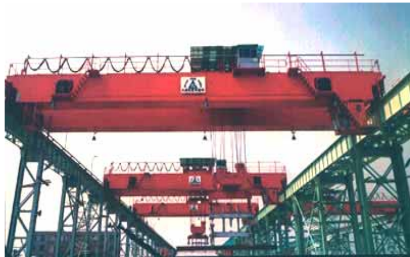
suspended beam crane