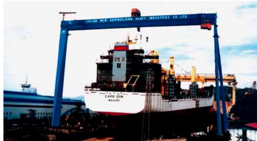
Gantry crane for shipbuilding