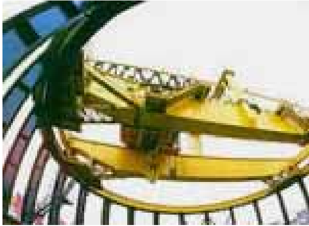
Circle crane for nuclear power plant