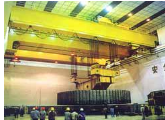
Heavy-duty crane for hydro power station