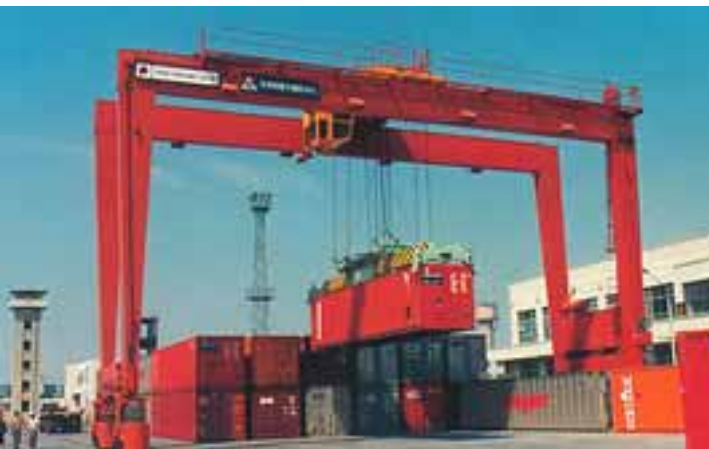
Tyre type container crane