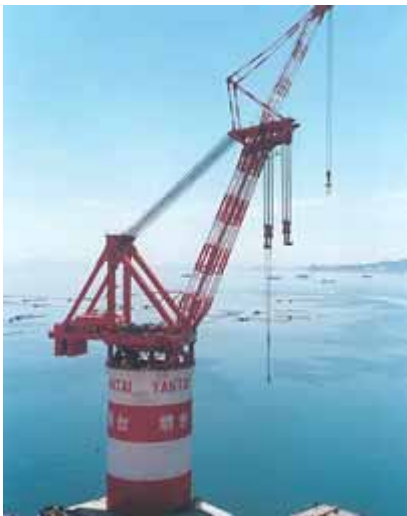
Fixed rotating crane