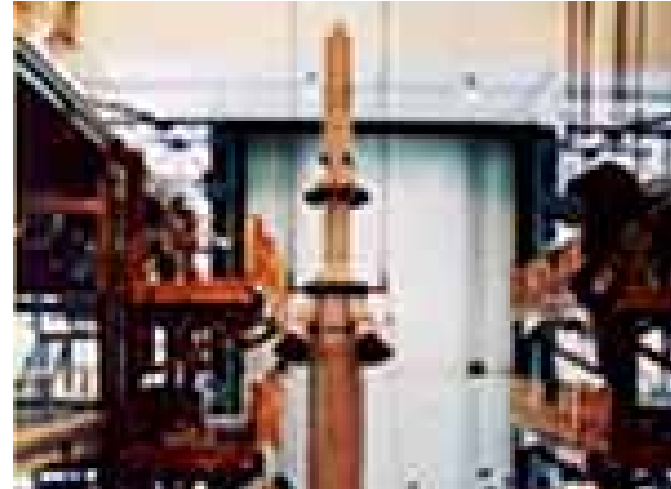
Double bridged crane for launching satellite