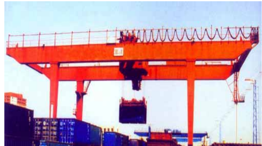
Gantry container crane