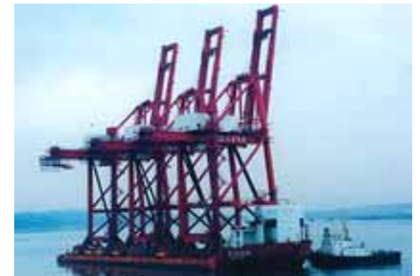
quayside container crane